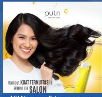
All Women - Salon treatment