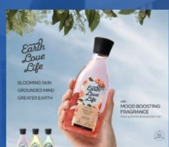
All gender care; with neuroscience-proven mood boosting fragrance