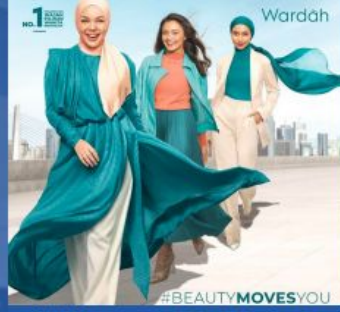
All Women with Halal Lifestyle