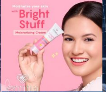
Teen & First User