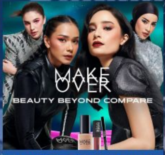
All Women - Prefessional MakeUp Crystallure