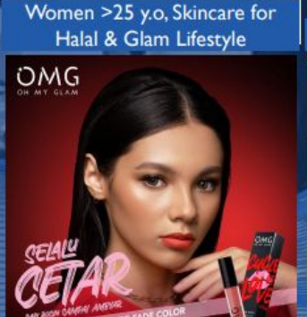
All Women - affordable makeup and skin care