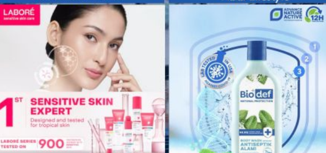
Moms with Kids