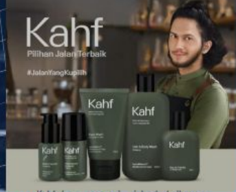
Male First Jobber & Beyond, Halal Lifestyle