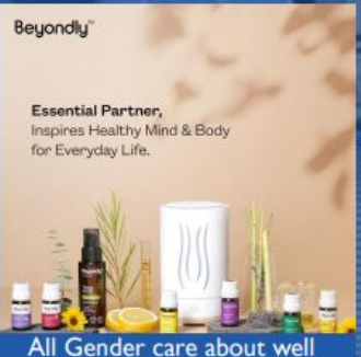
All Gender care about well being, wanna live beyond